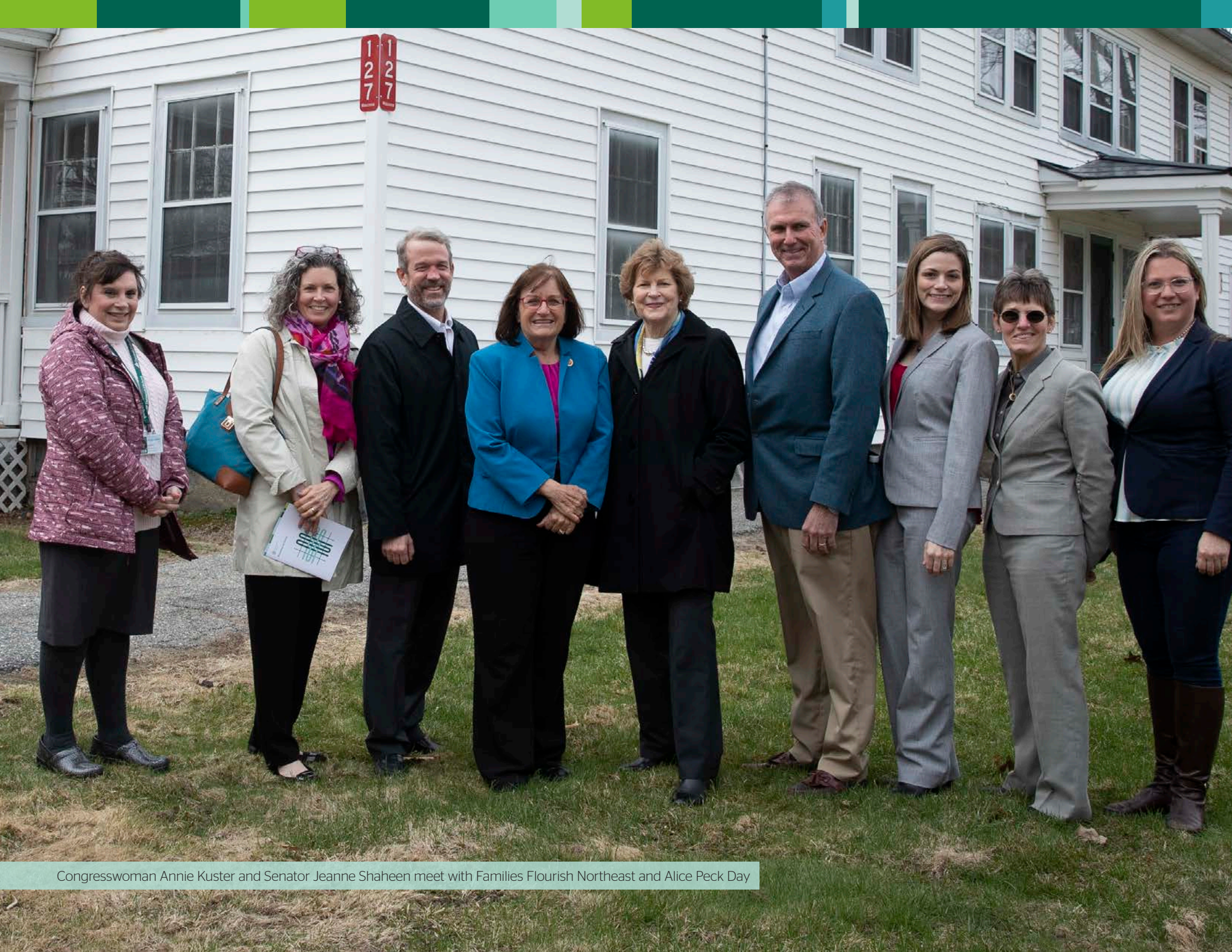
Congresswoman Annie Kuster and Senator Jeanne Shaheen meet with Families Flourish Northeast and Alice Peck Day