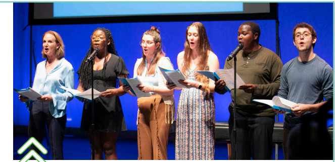
Northern Stage actors opened the program with song.