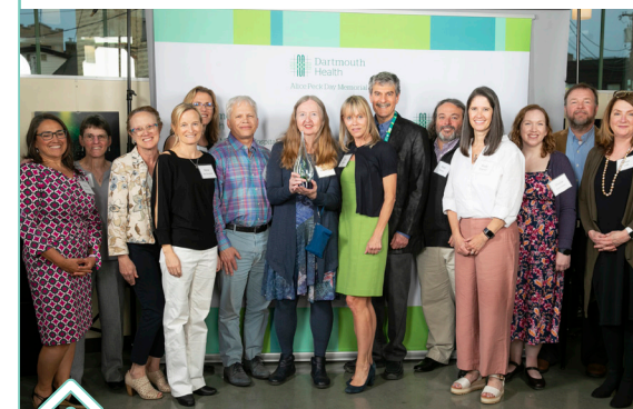
Members of the APD medical staff