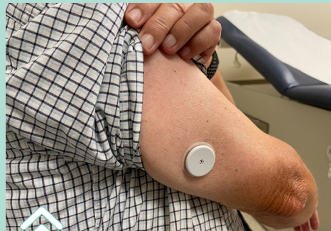
Patient with a Continuous Glucose Monitoring (CGM) device